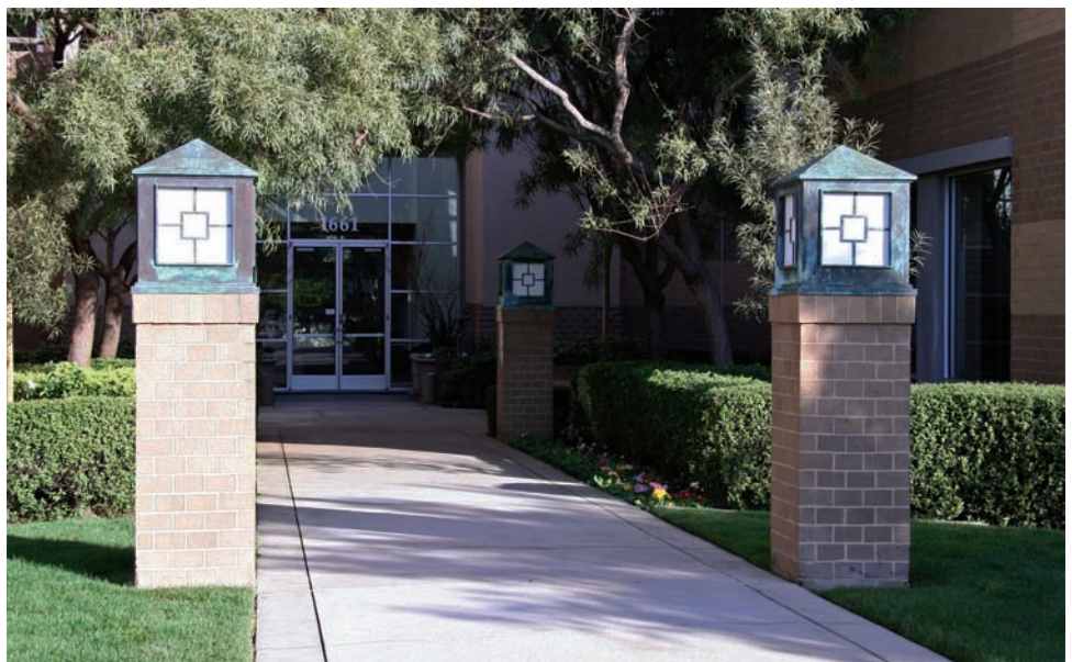
PROJECT: Andersen Consulting Palo Alto, CA (1993)

These pedestal mounted lanterns feature deep set diffusers with decorative bar trim providing a sense of entry. The solid bronze construction has a hand applied verdigris finish that will continue to weather.